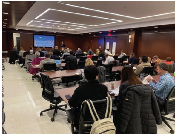
Symposium participants in the Buffalo Room

of the North Atlantic Treaty Organization and the Russian invasion of Ukraine in 2022. Then he analyzed decisions to maintain and expand the alliance before, during and after the end of the Cold War, and suggested ways they have shaped – and continue to shape – today's international system.