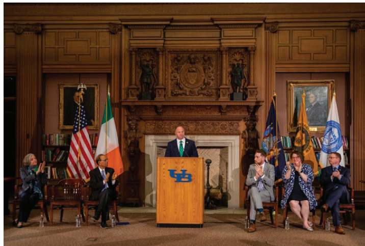
Senator Kennedy speaking at Abbott Library