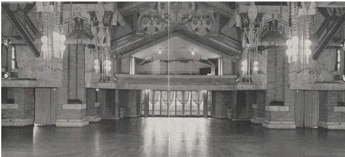
A photograph of the banquet hall of Wright's Imperial Hotel in Japan (University Archives)